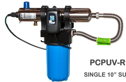
PCPUV-R1 SINGLE 10" SUMP