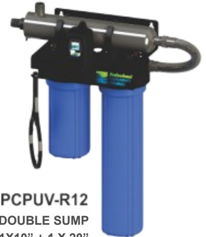
PCPUV-R12 DOUBLE SUMP 1X10" + 1 X 20"