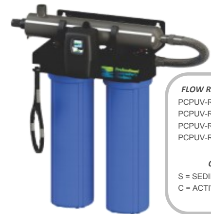
PCPUV-R22 DOUBLE SUMP 2 X 20"